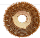
Advanced Surfacing Brush AS059000