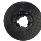
Pad Driver 30638A