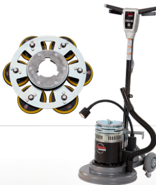
Epoch HD w/HydraSand 07233A 07233C*