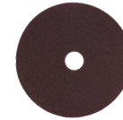
SPP Plus Pad