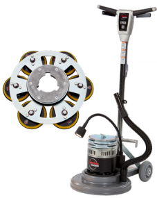
Epoch w/HydraSand 07217A 07219A*